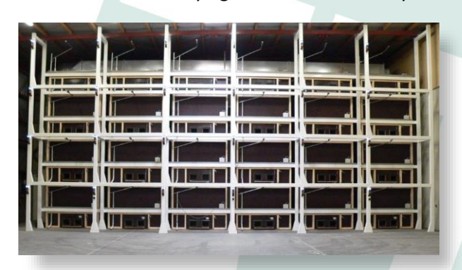
Example installation without boxes