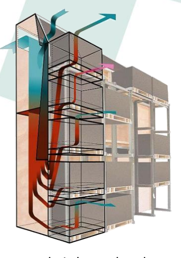
Extracted air heated and or dehydrated passes through each box individually.