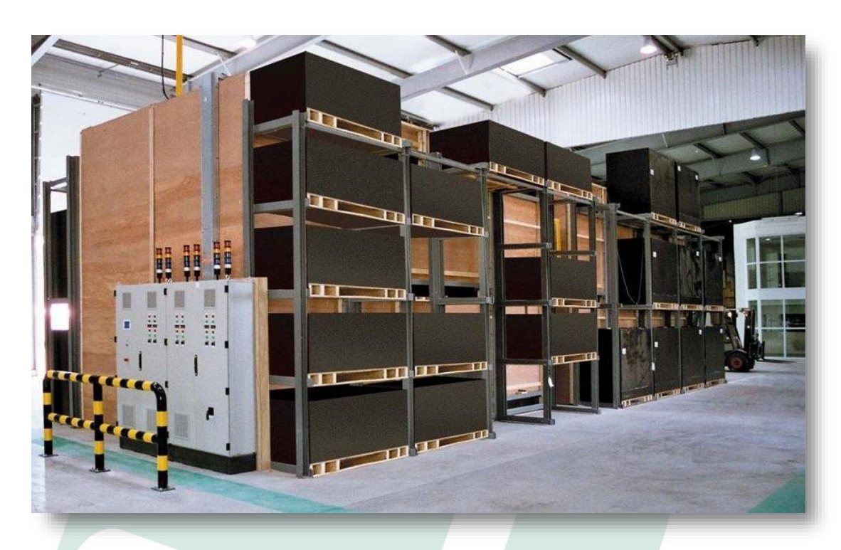
Drying each box individually to the desired moisture content of the seed.