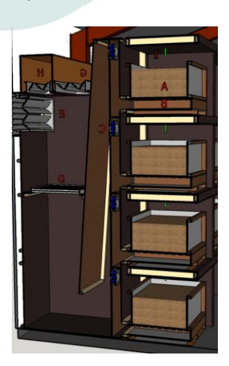
Drying of an individually box starts when placed in scaffolding and stops automatically when the seed is dry.