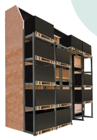
Boxes placed in scaffolding in front of drying installation. Box can be placed or taken one's ready.