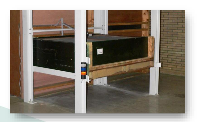
LED-lamps for indication status of drying.