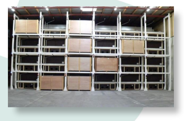
Installation partly filled with boxes