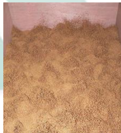
Fluid drying of wet seeds