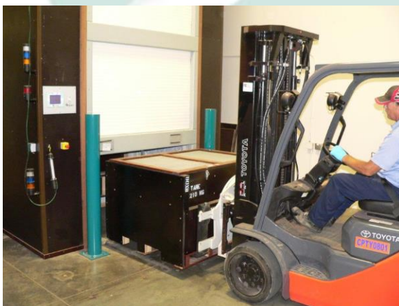
Drying box with seeds is placed into the drying unit