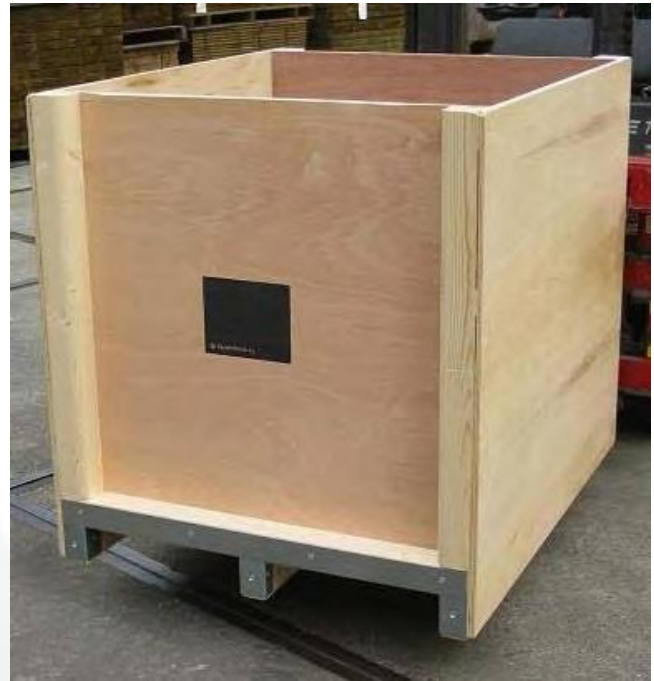
Pallet with steel protection.