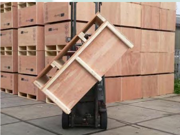
With extra provision, pallet can be turn over by fork lift truck in a safe way.