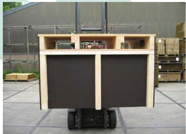
Box cannot move between the pile. The pallet cannot be damaged. Smoothly seed dosing.