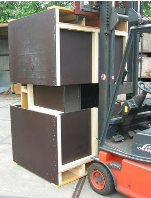
Boxes can be piled Pallets up; space saving.